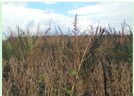
Michigan soybean field infested with waterhemp

Due to the limited postemergence (POST) herbicide options available, label restrictions, and lack of consistency observed with postemergence herbicides control of multiple-resistant Palmer amaranth and waterhemp is a challenge in Roundup Ready soybean. With LibertyLink, LibertyLink GT27, Enlist E3, and XtendFlex soybean there is more flexibility in use rates and the number of glufosinate (Liberty, Interline, Noventa, Scout, others) applications that can be made. Information on glufosinate use for POST Palmer amaranth and waterhemp control is outlined in Step 3.